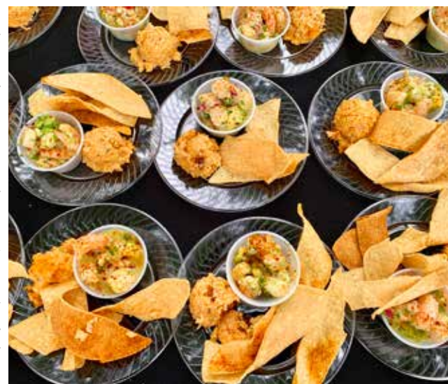
Bonefish Grill samples

flavors like Purple Mountain Majesty and Moose on the Loose. And at Puciugo Gelato Caffè. You can enjoy gelato just like being in Rome with their secret recipe and authentic ingredients.